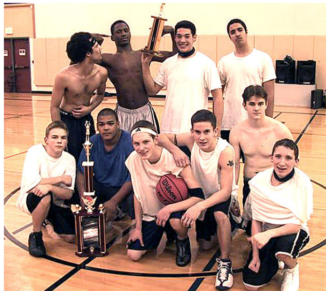
From left to right.

The tension mounted high on the court as each team had high stakes moving into this competition. Both teams invested many hours of sweat and energy into making it into this game. Half time came and the game's score gave no hint as to who would emerge as the WSF 2003 Basketball Tournament Champions. A 12 minute break, while the rest of Washington DeMolay shot three-pointers for Snickers bars, was well earned and much needed by both teams as they moved into the final half. The crowd yelling and tensions mounting the final buzzer sounded and a new victor had emerged. After having taken second place in 2002 to Vancouver Chapter, Occidental had finally gotten what they sought, the 1st place basketball trophy.